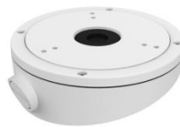
DS-1281ZJ-M Inclined Ceiling Mount