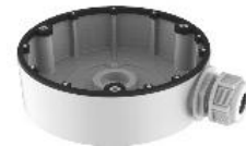
DS-1280ZJ-DM8 Junction Box