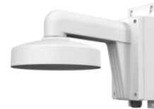
DS-1272ZJ-110 Wall Mounting Bracket