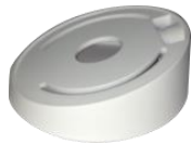
DS-1259ZJ Inclined Base Mounting Bracket