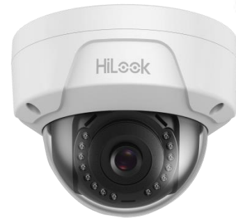
2.8 mm Fixed Focal Lens