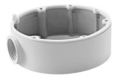
DS-1280ZJ-DM18 Junction Box